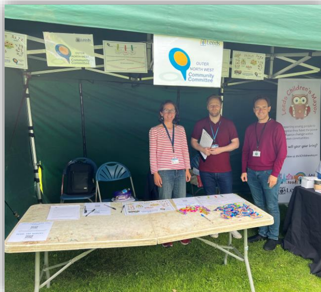
Guiseley & Rawdon Members at the Breeze event at Nunroyd Park, Guiseley

The Breeze in the park events had two main sessions, one running from midday to 2.30pm and the second from 3pm to 5.30pm. The adverse weather didn't deter local children and their parents from attending the events.